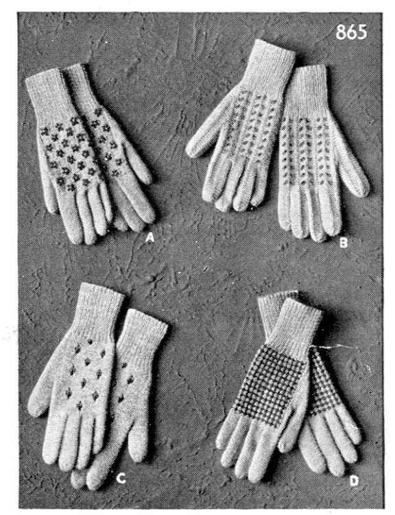
865-3d. Patons Super Crepe, 3-ply weight and White Heather Embroidery Wool