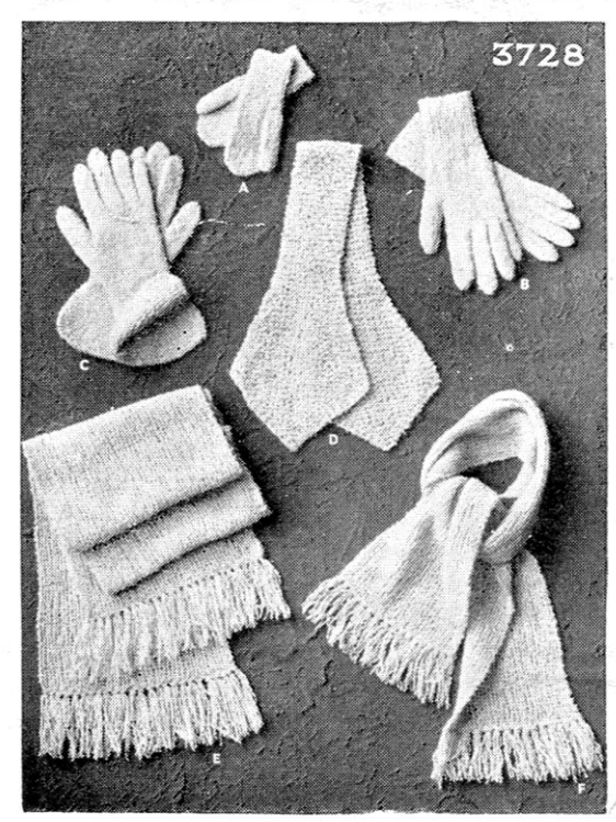
3728-3d. Cairn Rimple Wool.