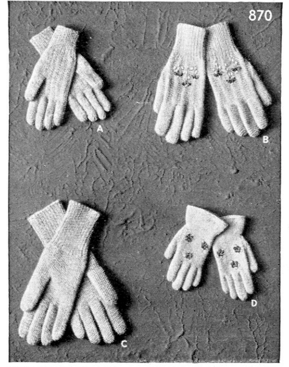
870-3d. Patons Super Crepe, 3-ply weight and White Heather Embroidery Wool.