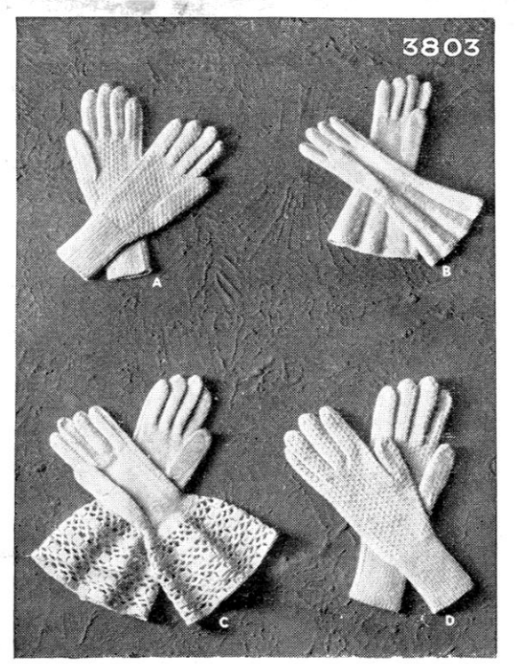
3803-3d. Patons Super Crepe, 3-ply weight.

Prices quoted throughout apply only in Great Britain and Northern Ireland.